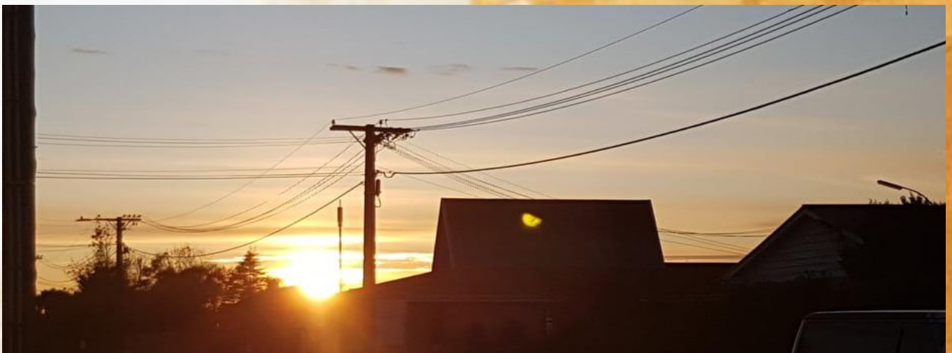
A Sunrise over our Church, Wednesday 6 May.

Steady As You Go Exercises: Age Concern Canterbury has published some exercises to try at home, these are gentle exercises but please take care when practicing them.